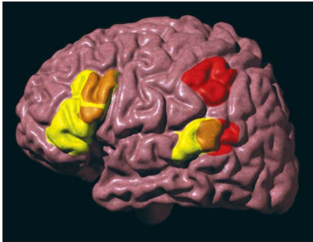
Wired for imitation? Classic language areas—Broca's and Wernicke's (yellow)—overlap (orange) with areas critical for imitation (red).

ture for imitation”—in people. He combined the results of single-cell brain recordings in monkeys with functional magnetic resonance imaging in humans while they watched or imitated finger movements or facial expressions. Iacoboni says that in addition to Broca's, the circuit comprises an area in the superior temporal cortex (which overlaps with Wernicke's and has neurons that respond to face and body movements) and one in the parietal cortex, the homolog to the macaque area called PF, which combines visual and bodily information. “The neural architecture for imitation ... overlaps very well