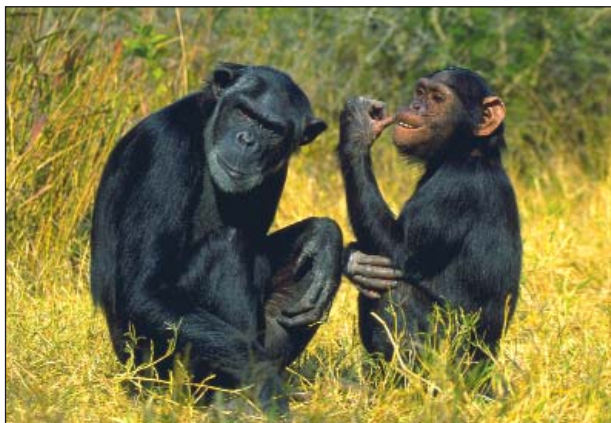
Hand and mouth. Chimps gesture with both face and hands to help express themselves.