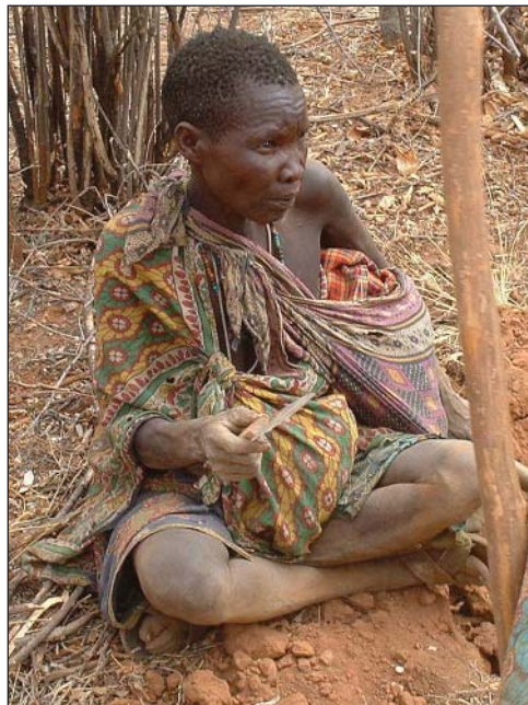
All alone. Researchers ponder why the Hadzabe live so far from other click speakers.